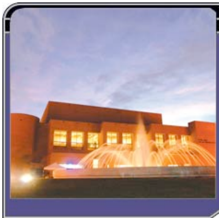
The University of Texas at Tyler

The Constitution directs the UT Board to establish a distribution policy that provides stable, inflation-adjusted distributions to the AUF and preserves the real value of the PUF Investments over the long term. To achieve these goals, the UT Board has adopted a "percent of assets" spending policy for the PUF. Currently, the distribution rate is set at 4.75% of the prior twelve quarters' average net asset value of PUF Investments unless the average annual rate of return of PUF Investments over the trailing twelve quarters exceeds the expected return of the endowment policy portfolio by twenty-five basis points or more, in which case the distribution is calculated at 5.00% of the trailing twelve quarters' average net asset value. Under this policy, dollar distributions vary with the volatility inherent in financial markets. Although