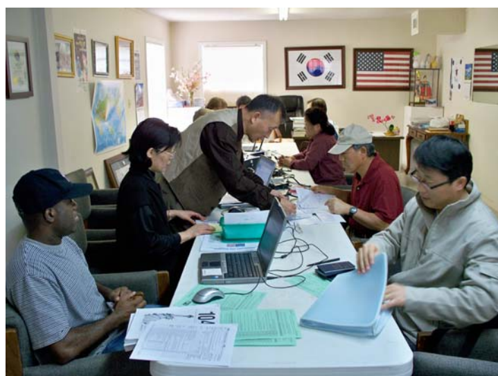
PVAMU Students, Staff, and Faculty assist VITA clients at the Korean-American Association.

In addition to holding twice-weekly preparation sessions at the College of Business, COB VITA held two Saturday sessions at the First Methodist Church in Waller and five