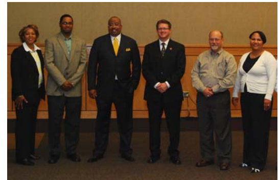
Advisory Board Members at Fall 2008 Meeting.