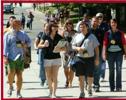
Participants Crossing the Campus

The Donald D. Gebring Academy for Student Conduct Administration will be held June 22-26, 2009 on the beautiful campus of the University of Utah in Salt Lake City, Utah. The Academy has been recognized as the premiere professional development experience for student conduct administrators for 16 years.