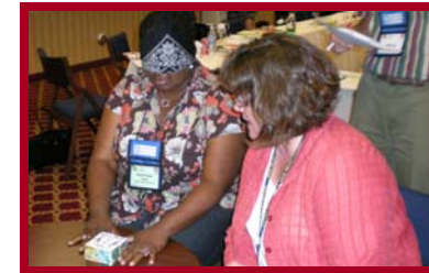
Conflict Resolution Session