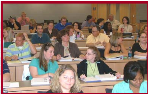
Training Institute Session

Conducted over five full days, the Academy curriculum offers four unique programs from which to choose. Each program is highly interactive combining theory and practical application supplemented by informal reflection with colleagues and faculty. Please review on-line registration materials in March and wait for participation confirmation before finalizing non-refundable travel plans.